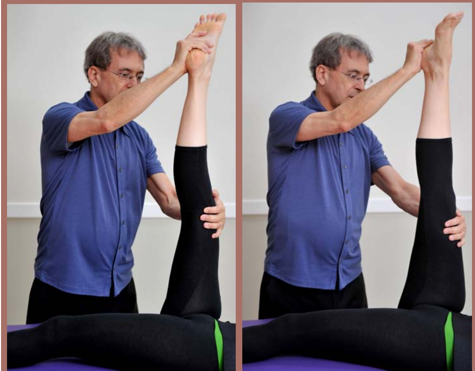
Two of the six AIS hamstring stretches

The movements involved in AIS are quite gentle, never approaching a muscle's maximum sustainable force (i.e., the level of force that will cause that muscle to give out). Laboratory studies confirm that to avoid injury, it's important to use 50% or less of the maximum force for the muscles being stretched. 2 Gradual, gentle motion also helps to delay activation of the myotatic reflex (commonly referred to as the stretch reflex) — a defensive mechanism that is designed to prevent muscles from stretching too far or too fast. A movement that's overly sudden or severe will cause the muscle being stretched to reflexively contract.